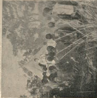
Mass in the Bush

The Prefect Apostolic appeals for help. He asks for prayer. He asks for a steady flow of monetary aid.