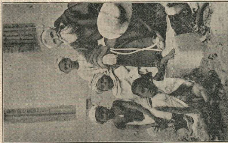
FEELING AT HOME

All who aid in the work of the Missions participate in the sacred work of bringing the light of the Gospel to pagans, and will receive recompense from Him Who loves souls, and wishes them to come to the knowledge of the Truth. In addition they will share in the Masses, prayers and good works of the Fathers and Brothers of the Irish Capuchin Province, of those in Ireland and in the United States, and of the Missionaries in far-off Africa.