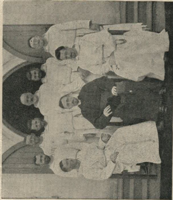
THE PREFECT APOSTOLIC AND OTHER IRISH CAPUCHINS IN AFRICA

It is one of the best ways of assisting the Capuchin Foreign Missions ; and the benefactors of these Missions can, by joining it, gain for themselves and their deceased relatives great spiritual benefits.